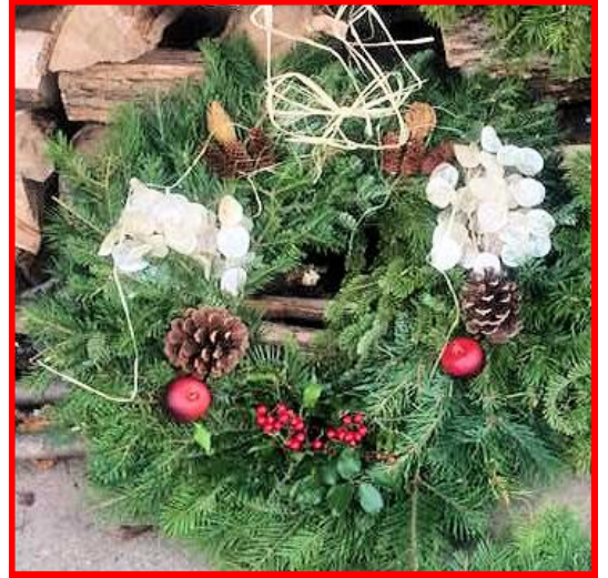
Home made wreaths for sale...