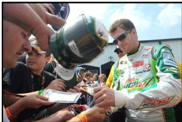
Dale Earnhardt Jr., shown before a NASCAR race at Pocono Raceway in 2012, is a legend in the sport, but has retired and is now doing TV commentary.