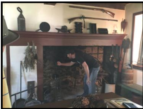
Retired NASCAR racing legend Dale Earnhardt Jr. researches his ancestors Dale Jr. (center) checking out hearth of 1803 House in Emmaus.